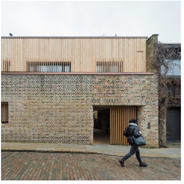
Max Fordham House (London) by bere Architects

Designed in collaboration with the renowned physicist and engineer Max Fordham, the elevations of this house are largely driven by the requirement to accommodate horizontally-sliding thermal shutters within the internal fabric of the building. Automatically operated, insulated internal window shutters have been developed for the project, and the intention is to test the completed building without any supplementary heating.