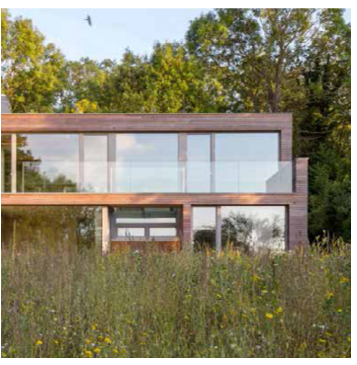
Lark Rise (Buckinghamshire), bere Architects

Lark Rise is an all-electric, two-bedroom guest house designed to Passivhaus standards, producing at least twice as much energy in a year as it requires, while maintaining a very high level of comfort all year round. Ventilation is provided through MVHR units.