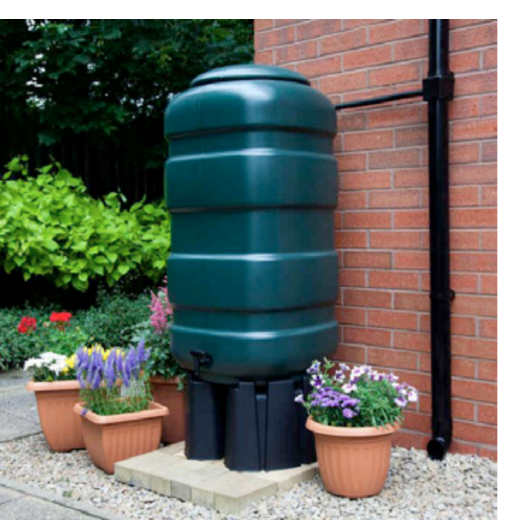
Example of domestic water management; water butts

A water butt is essentially a large container used to capture and store rainwater. When attached to a downpipe, the water butt collects the rainwater that lands on the roof of a building so it can be used later. It is this time of year, when rainfall has been scarce, that water butts become really useful.