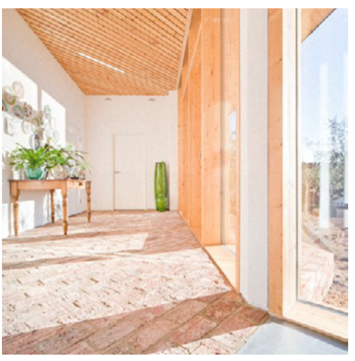
Manor Farm (Oxfordshire) by Transition by Design

Extension to a listed Georgian country house that provides the home with new kitchen, dining room, garden room and utility spaces and follows sustainable design principles. The solar gains are optimised to the south allowing light and warmth to pour into the garden room yet protected in excess summer heat by the oversailing roof