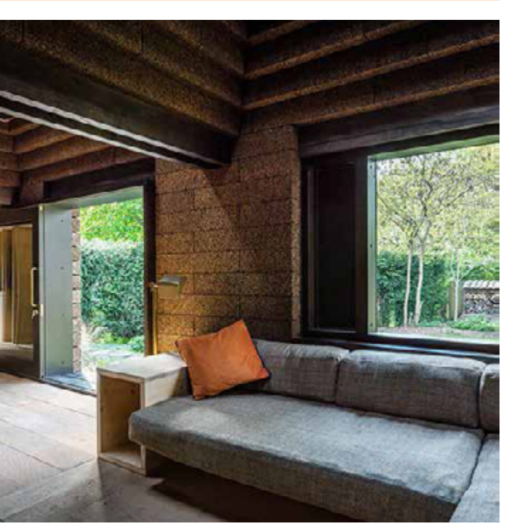
Cork House, Matthew Barnett Howland with Dido Milne and Oliver Wilton

The Cork House is a residential extention project which explores the use of low carbon materials. Solid structural cork is used for the walls and roof of this building, resulting in the building having exceptionally low whole life carbon.