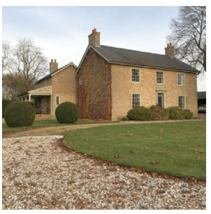
1860s Farm (Huntingdon), pump by Finn Geotherm

A ground source heat pump was installed in this 1860s farmhouse to replace an oil-fired boiler. The pump heats up radiators throughout the house, as well as provides hot water. The heat pump also runs entirely on renewable energy generated by the farm's own turbine, making the farm carbon positive.